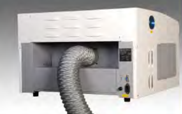
Rear side for Facility exhaust