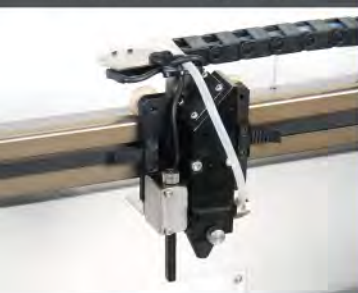
Pin Type Auto Focus