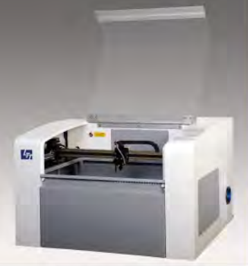
Acrylic top door opening