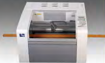
Both side opening for long material