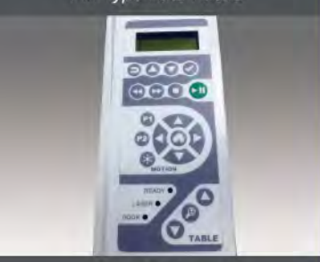
4 Line LCD panel